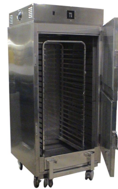
Rack not included