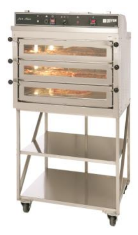
PIZ3B Equipment Stand (shown with PIZ3 oven)