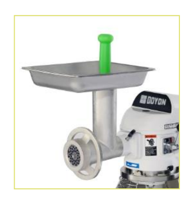
SM100HV meat grinder attachment