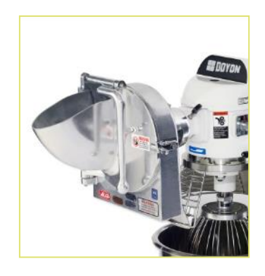
SM100CL slicer attachment